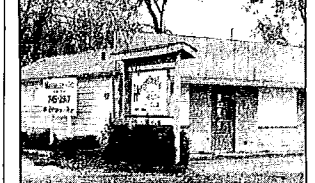
The Honeyuckle Health Club